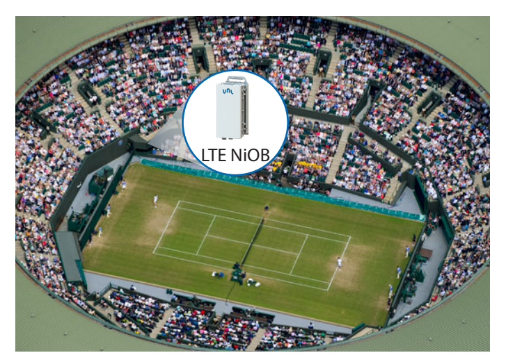
Broadband Cellular Coverage in Tennis Court