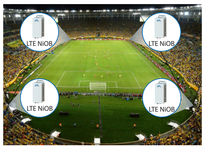
Broadband Cellular Coverage in Football Court

For further information visit our website www.vnl.in